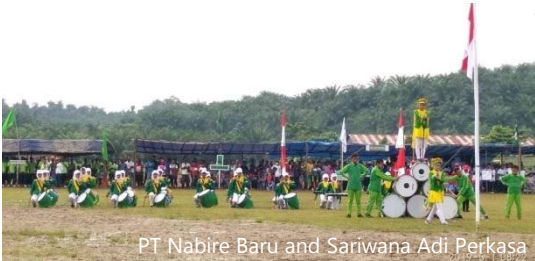
PT Nabire Baru and Sariwana Adi Perkasa