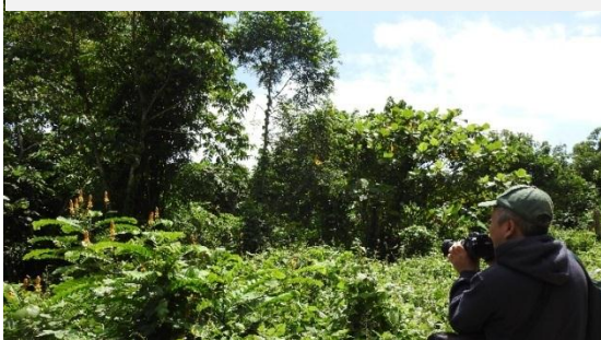
Survey of HCV areas.