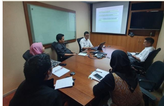
Traceability - Training for logistic, sale operation, Sustainability, Government relation and compliance, 13 th May 2019.