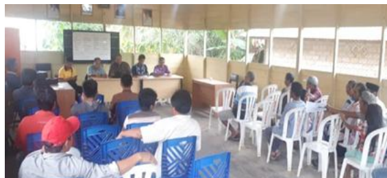
Traceability Socialization at Batu Agung village, Central Kalimantan, May 2019.