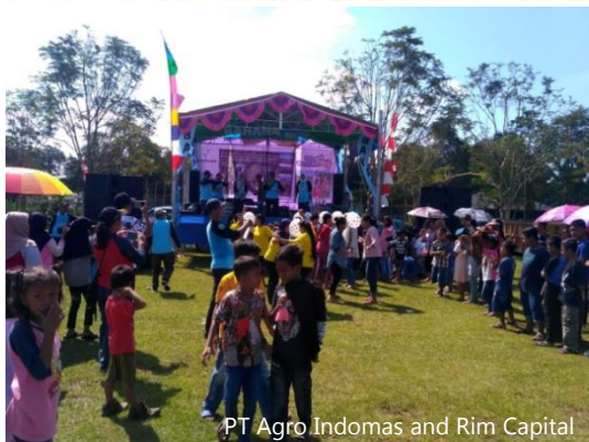
PT Agro Indomas and Rim Capital