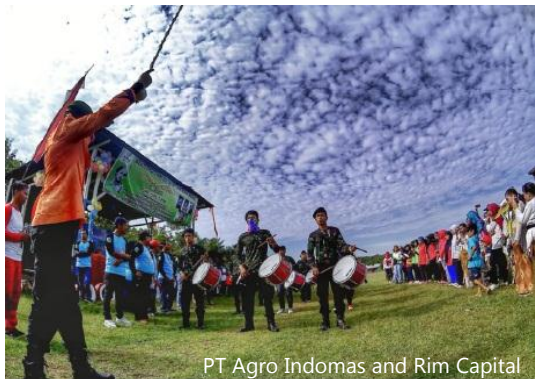
PT Agro Indomas and Rim Capital