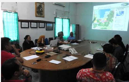
Conservation Management Planning Meeting at PT Nabire Baru.