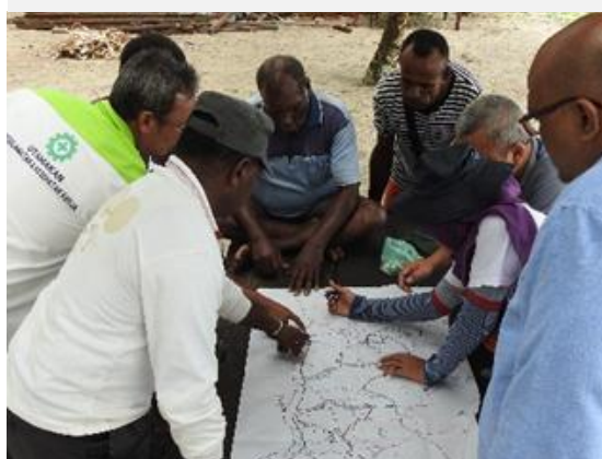
Participatory mapping for conservation management planning.