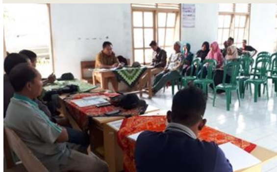
Traceability Socialization at Bukit Indah village, Central Kalimantan, May 2019.