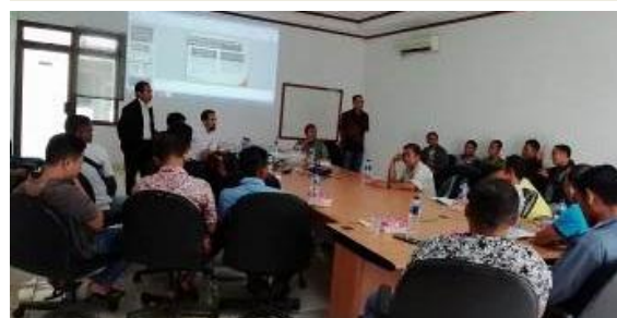
Tax Administration Training for Plasma Cooperative Management, PT Agro Bukit, Central Kalimantan, 15 th April 2019.