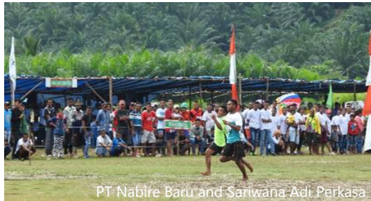
PT Nabire Baru and Sariwana Adi Perkasa