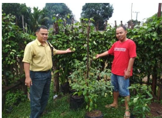
Passion fruit small business enterprise.