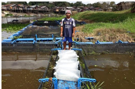
Sustainable fish farming initiative in Terawan Village, Central Kalimantan.