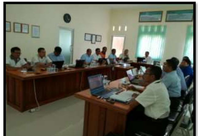
Meeting with Verité team in Indonesia

The workshop was designed to facilitate: