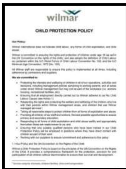
Excerpt of Wilmar's Child Protection Policy

The scope of the HIRARC will cover workers' housing, general areas, areas of particular danger, and all other child specific areas under direct Wilmar management (i.e. Wilmar schools, creches, school buses). The result of the HIRARC will inform safety measures that will be needed to ensure Wilmar plantations and estates are safe for the children of our workers to live and play. We are also conducting specific engagement sessions on the CPP to all our suppliers in 2018, in collaboration with our implementation partners.