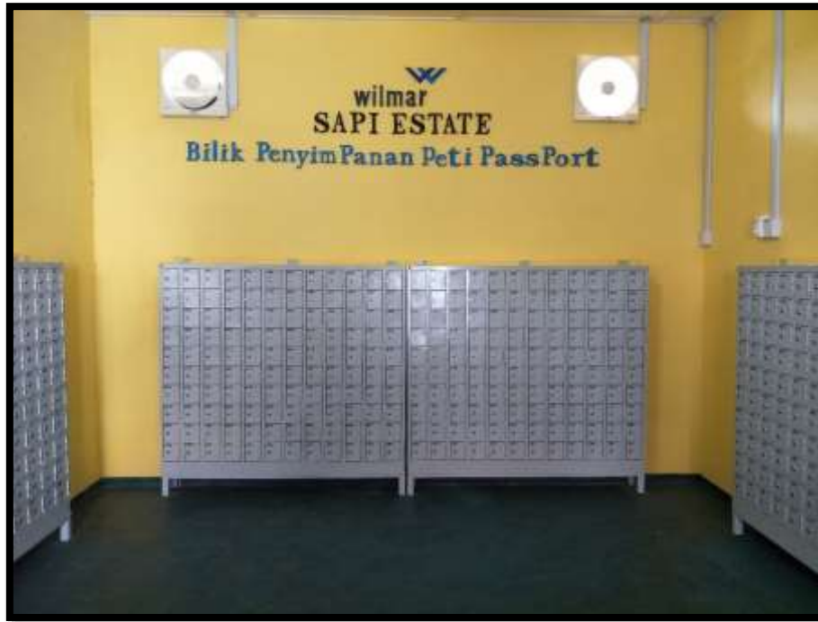
Passport Locker Facilities in Wilmar's Sapi estate in Sabah

In many Malaysian plantations, it is commonplace for employers to take possession of workers' passports, to prevent workers from leaving without notice as it will incur cost and administrative implications such as, reporting to the various authorities. Recognising that passport retention is a key indicator of forced labour, Wilmar has taken a step forward in improving worker's rights by returning passport to our workers in phases, starting from June 2016. The initiative reinforces the Group's strong commitment to protect the rights of workers, and uphold the principles enshrined in the International Labour Organisation (ILO) core labour standards - a key tenet of our No Deforestation, No Peat, No Exploitation (NDPE) policy. Taking a step further, Wilmar has provided locker facilities for workers to safe keep their passports. The locker keys are kept by the workers themselves and they can access their passport without restriction. We have installed about 10,000 lockers and returned passports to all migrant workers in all our Malaysian plantation. We received very positive response from our workers who expressed satisfaction with the initiative and we believe that it has fostered a higher level of trust between workers and the company.