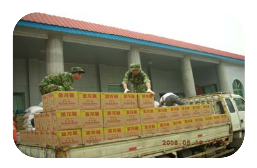
Adhering to good corporate citizenship, helping in times of national crises.