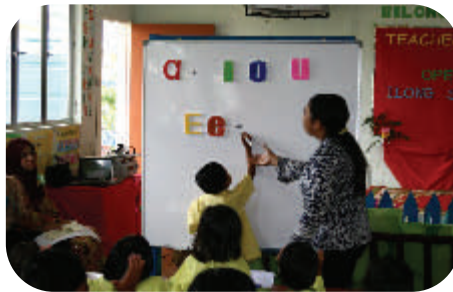
Interactive and fun learning experience