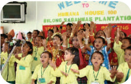
Children performing for guests