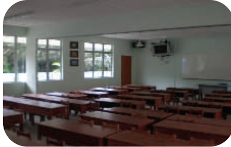
Spacious, bright and clean classrooms