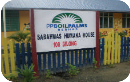
Signpost: Sabahmas Humana House

The educational levels range from kindergarten to Primary Six for the classes. Children are assigned to the different levels based their own educational level, not by age. The children can attend up to six years of school, which