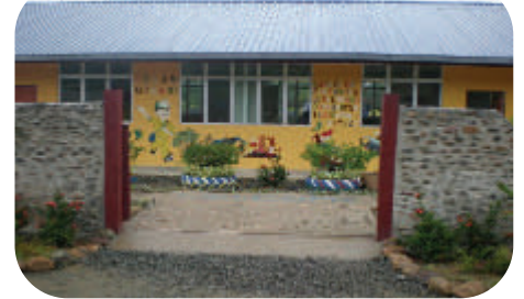
Main entrance to one of the four schools

will enable them to obtain an equivalent qualification as the Ujian Pencapaian Sekolah Rendah. (UPSR) The UPSR is a national examination undertaken by all the Standard Six students in Malaysia.