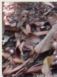
Leaf litter decomposition