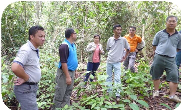
Demonstration in the field on forest quality

The success of this partnership will be continued in 2016 for a further 5 years, with more projects related to the assessment and maintenance of conservation values and ecosystem functioning in agricultural landscapes and the sustainable management of oil palm plantations and their embedded forest patches and riparian reserves. This also includes exploring possible greenhouse gas reductions in existing palm oil operations. A memorandum of understanding is expected to be signed by Wilmar and SEARRP in the first quarter of 2016. For more information please visit : http://www.sensorproject.net/knowledge-exchange/