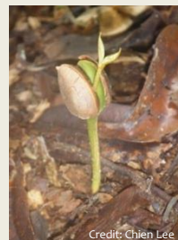
Dipterocarp seedling occurrence