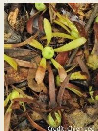
Dipterocarp fruit occurrence