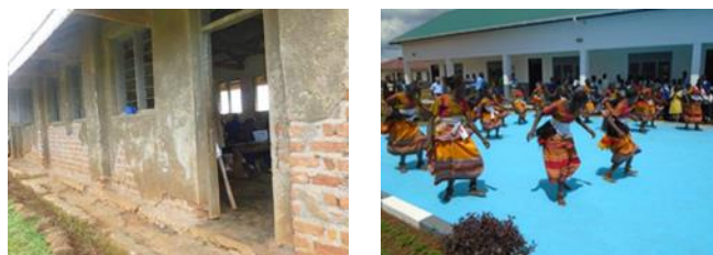
St Thereza Bwendero Primary School before (left) and after (right) redevelopment.

Wilmar adopted and redeveloped a neighbouring government school, St. Thereza Bwendero Primary School, which was in desperate need of upgrading.