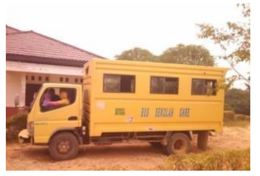
Figure 11. School Bus