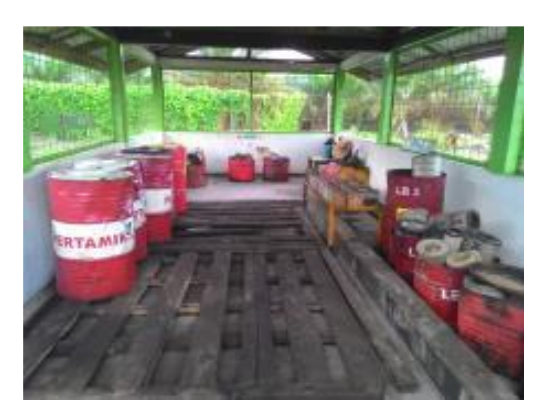
Figure 6. Temporary Hazardous Waste