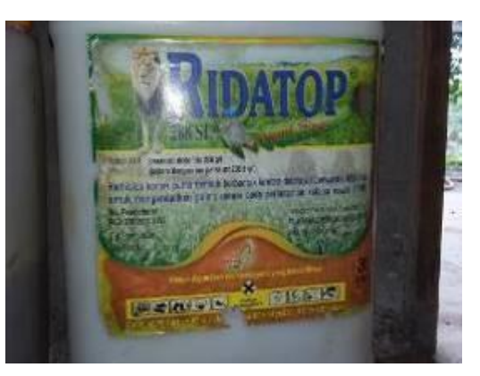
Figure 9. Hazardous Chemicals