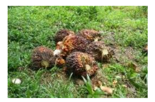
Figure 17. FFB at a smallholder