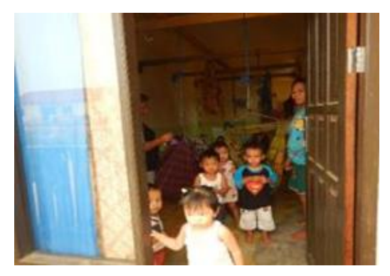
Figure 10. Day Care