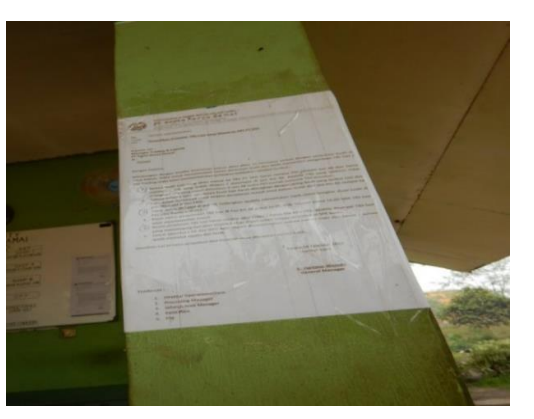
Figure 15. FFB pricing announcement