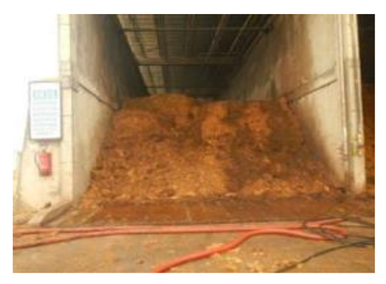
Figure 8. Empty Fruit Bunches turned into Fertilizer