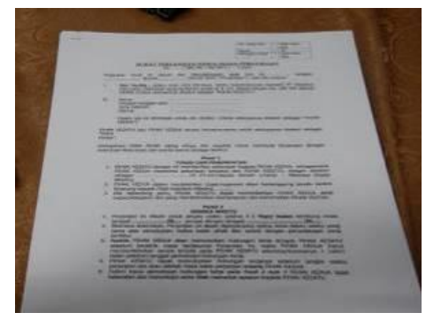
Figure 12. Sample Employment Contract