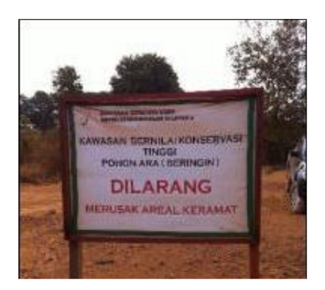
Figure 4. HCV area signage