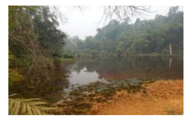
Figure 5. A protected lake