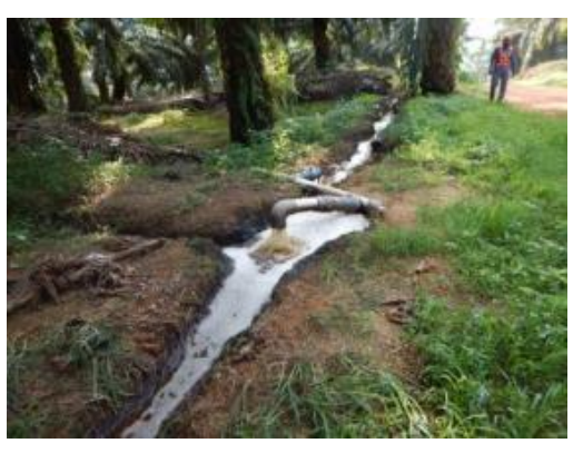
Figure 7. Land Application of Waste