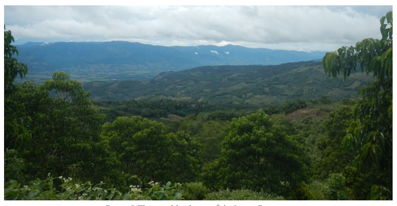
Figure 2 The mixed landscape of the Leuser Ecosystem

There are also significant areas of oil palm smallholdings both within the Leuser Ecosystem and the Leuser National Park that have been in existence for many years. Recent adjustments to the forestland designation maps for Aceh have resulted in areas within the Leuser Ecosystem having their land use status changed from areas of "Forest" to "Land For Other Uses (APL)". This included some areas of established smallholder plantations within the Leuser National Park.