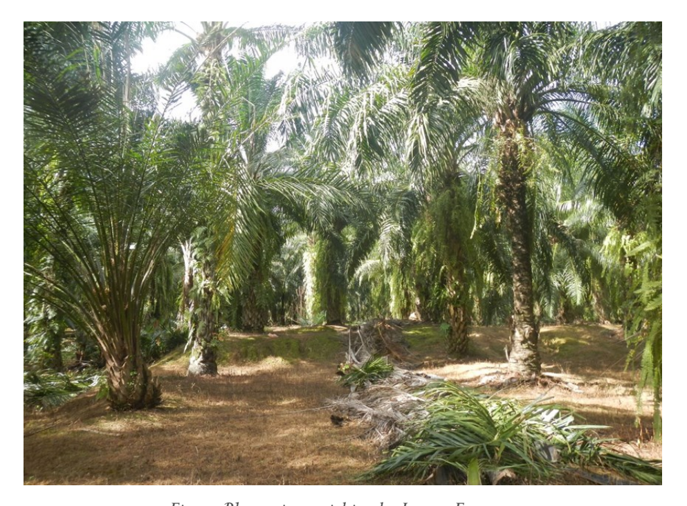
Figure Plantations within the Leuser Ecosystem