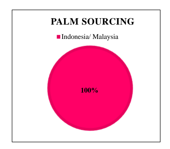
Last Updated : 27 Apr 2016

The charts below represent total volumes of palm products sourced from various origins into United States of America in January - December 2015: