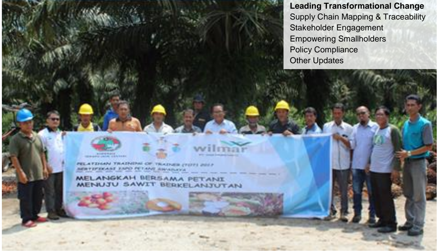
Smallholder training session in Riau