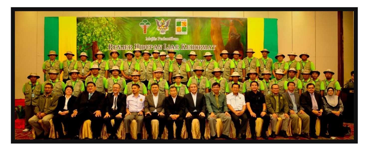
Group photo with the newly appointed Honorary Wildlife Rangers

While Wilmar may be the first plantation company in Sarawak to have the Honorary Game Warden Programme, this is certainly not the first of such programme in the Group. We have a similar programme in Sabah which has contributed to the protection of iconic species such as orangutans and Sumatran rhinoceroses. Given our success and track record in the neighbouring State, we are confident this initiative would help us to maintain the integrity of our conservation area and contribute meaningfully to Sarawak's conservation initiatives.