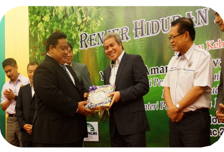
Token of appreciation to the Minister.