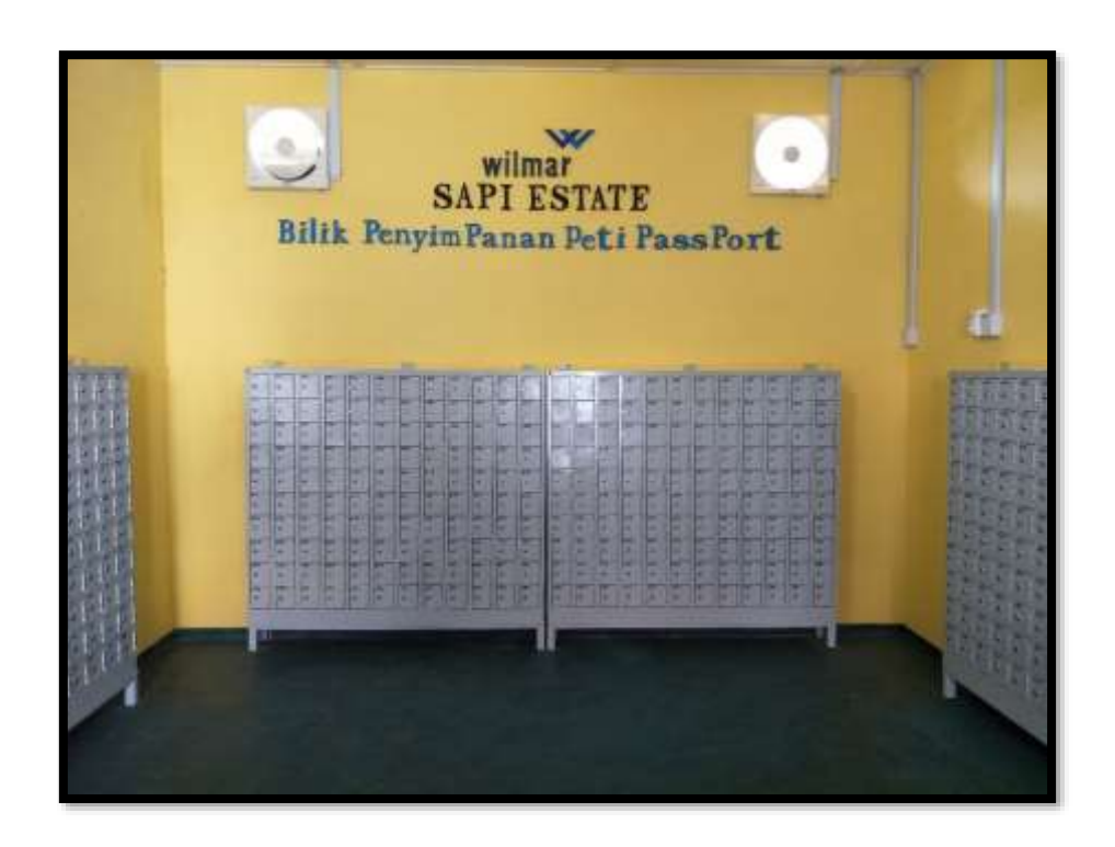
Passport Locker Facilities in Wilmar's Sapi estate in Sabah

In many Malaysian plantations, it is commonplace for employers to take possession of workers' passports, to prevent workers from leaving without notice as it will incur cost and administrative implications such as, reporting to the various authorities. Recognising that passport retention is a key indicator of forced labour, Wilmar has taken a step forward in improving worker's rights by returning passport to our workers in phases, starting from June 2016. The initiative reinforces the Group's strong commitment to protect the rights of workers, and uphold the principles enshrined in the International Labour Organisation (ILO) core labour standards - a key tenet of our No Deforestation, No Peat, No Exploitation (NDPE) policy. Taking a step further, Wilmar has provided locker facilities for workers to safe keep their passports. The locker keys are kept by the workers themselves and they can access their passport without restriction. We have installed about 10,000 lockers and returned passports to all migrant workers in all our Malaysian plantation. We received very positive response from our workers who expressed satisfaction with the initiative and we believe that it has fostered a higher level of trust between workers and the company.