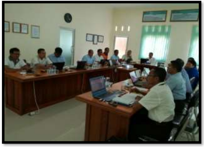
Meeting with Verité team in Indonesia