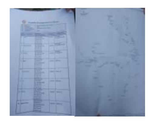
Figure 16. Smallholder's data and supplier map