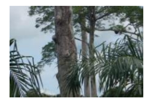
Figure 3. Select trees with beehives