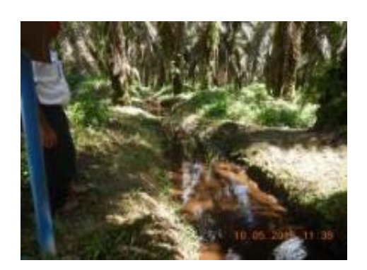
Figure 8. Land application of liquid waste Figure 9. Example of hazardous chemicals