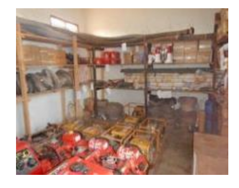
Figure 7. Fire fighting equipment storage facility