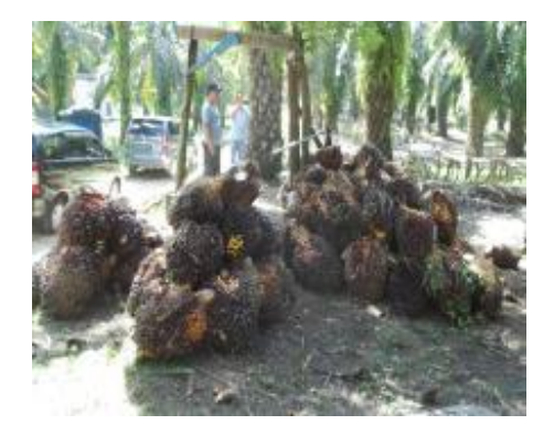
Figure 17. FFB at smallholder's plantation