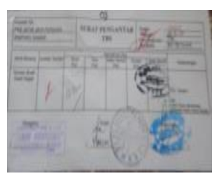
Figure 14. FFB delivery note