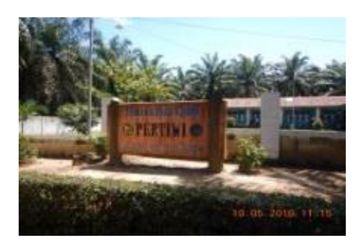
Figure 10. Educational facility at the plantation