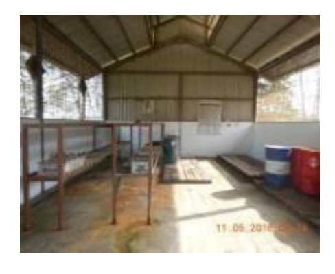
Figure 6. Temporary storage facility of hazardous chemical waste