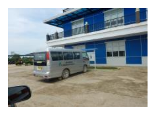
Figure 11. School bus