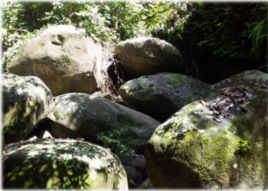
Gerowong (1.0 km)