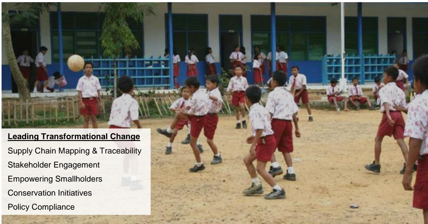
School children in Wilmar's estate in Indonesia