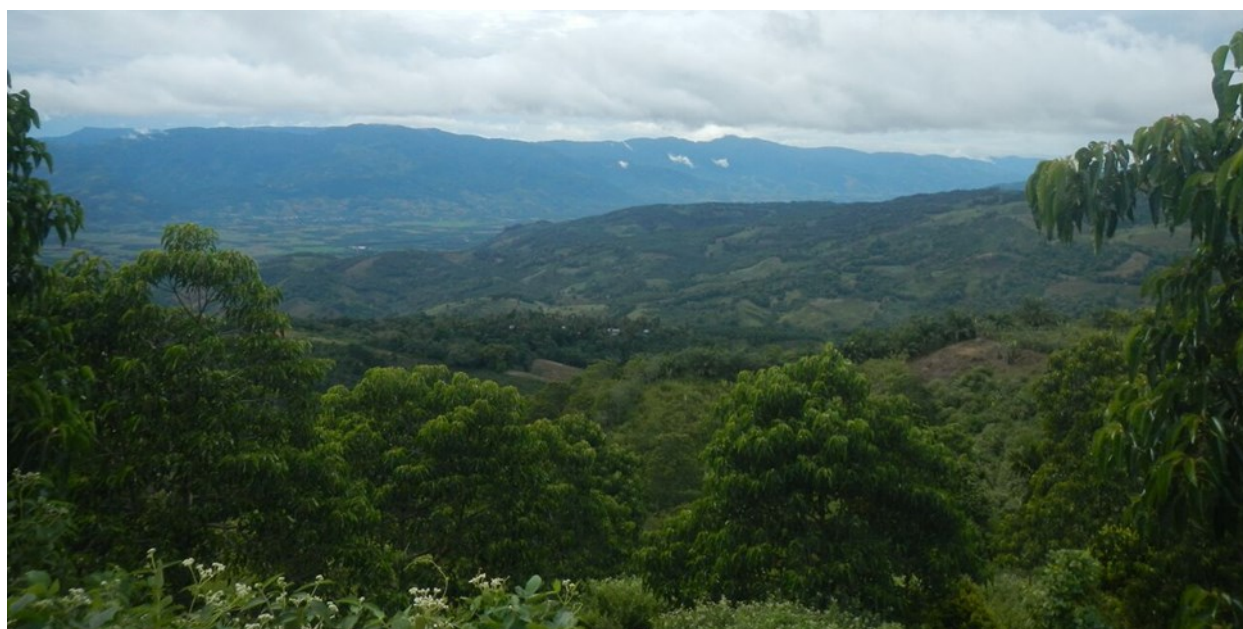
Figure 2 The mixed landscape of the Leuser Ecosystem

There are also significant areas of oil palm smallholdings both within the Leuser Ecosystem and the Leuser National Park that have been in existence for many years. Recent adjustments to the forestland designation maps for Aceh have resulted in areas within the Leuser Ecosystem having their land use status changed from areas of “Forest” to “Land For Other Uses (APL)”. This included some areas of established smallholder plantations within the Leuser National Park.