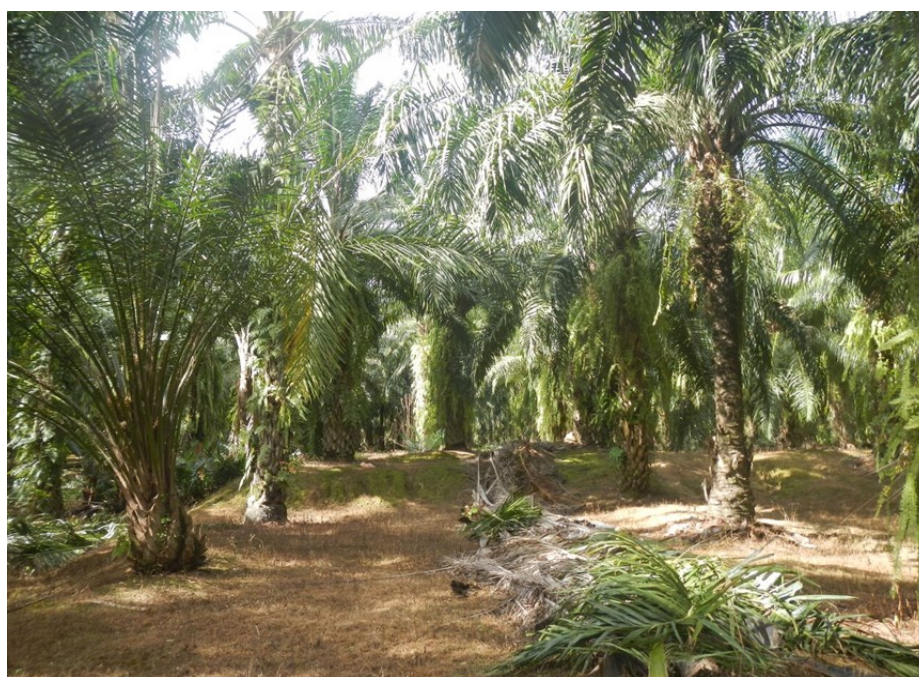
Figure Plantations within the Leuser Ecosystem