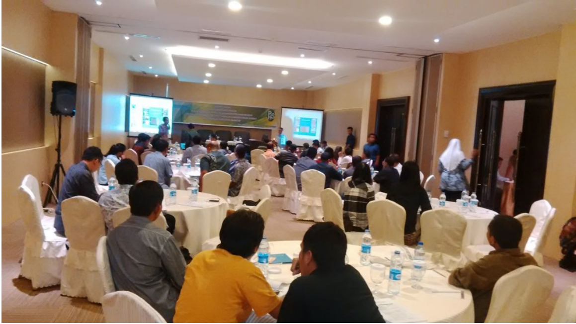
Figure 3 Stakeholder Consultation Meeting

Wilmar conducted a stakeholder consultation meeting together with our NGO partners in Medan during September 2015 to better understand the concerns of local NGOs, community representatives and stakeholders. In total, 49 local NGOs attended the meeting including representatives from local organisations working on conservation efforts in the Leuser Gunung National Park and the Leuser Ecosystem.